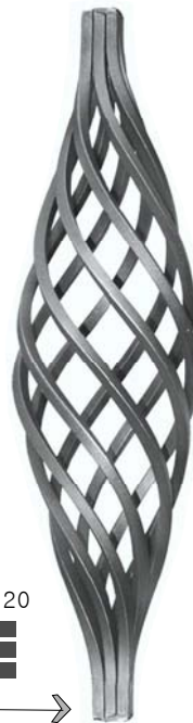
BKL-18 Base 20x20 (0.960 kg.-2.116 lbs.) Dia. 95 x 360 mm.-3 3 / 4 x14 1 / 4 " 8 sections of 6x6