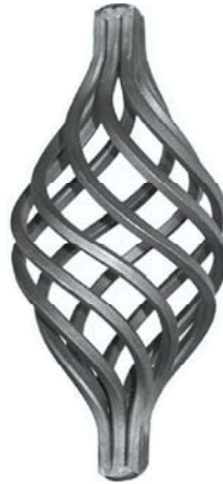
BK-16/1 Base 16x16 (0.335 kg.-0.738 lbs.) Dia. 68 x 158 mm.-2 3 / 4 x6 1 / 8 " 8 sections of 5x5