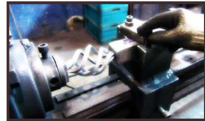
Pressing & simultaneous twisting to form a BASKET from pre-welded steel sections

Base 16x16 Dia. 70 x 160 mm. - 2-3/4"x2-3/8" (0.445 kg.-0.981 lbs.) 4 sections of 8x8