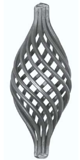
BK-20/1 Base 20x20 (0.605 kg.-1.333 lbs.) Dia. 85 x 197 mm.-3 1 / 4 x7 3 / 8 " 12 sections of 5x5