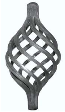
BK-12/1 Base 12x12 (0.190 kg.-0.420 lbs.) Dia. 60 x 130 mm.-2 3 / 8 x5 1 / 8 " 8 sections of 4x4