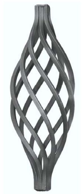
BKL-24 Base 25x25 (1.665 kg.-3.670 lbs.) Dia. 120 x 360 mm.-4 3 / 4 x14 1 / 4 " 8 sections of 8x8