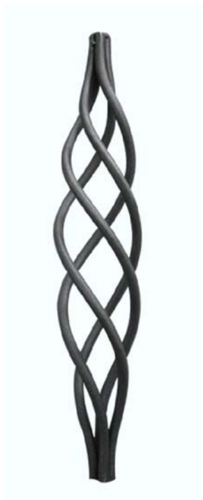
BKL-16/R Base 16x16 (0.630 kg.-1.393 lbs.) Dia. 82 x 360 mm.-3 1 / 4 x14 1 / 4 " 4 sections of dia.8