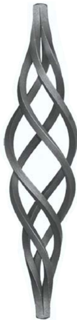
BKL-16 Base 16x16 (0.830 kg.-1.829 lbs.) Dia. 82 x 360 mm.-3 1 / 4 x14 1 / 4 " 4 sections of 8x8