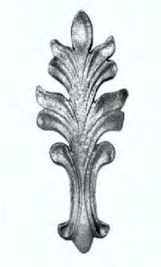
CT-025 ( Cast weldable front leaf ) 0.210 kg. - 0.462 lbs. Dim. 80 x 185 mm. 3"2/16 x 7"2/8