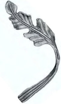
CT-027(L) ( Cast weldable leaf ) 0.365 kg. - 0.804 lbs. Dim. 65 x 230 mm. 2"4/8 x 9"