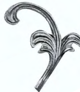
CT-030(R) ( Cast weldable leaf ) 0.150 kg. - 0.331 lbs. Dim. 95 x 105 mm. 3"3/4 x 4"