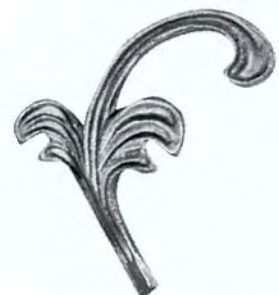
CT-031(L) ( Cast weldable leaf ) 0.150 kg. - 0.331 lbs. Dim. 95 x 105 mm. 3"3/4 x 4"