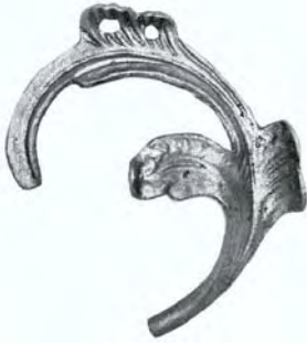
CT-019(L) ( Cast weldable leaf ) 0.410 kg. - 0.903 lbs. Dim. 160 x 190 mm. 2"5/16 x 7"4/8