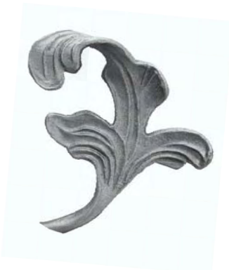
CT-029(L) ( Cast weldable leaf ) 0.310 kg. - 0.683 lbs. Dim. 105 x 165 mm. 4"1/8 x 6"4/8