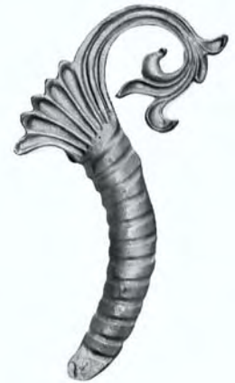
CT-024(R) ( Cast weldable Decor ) 0.800 kg. - 1.763 lbs. Dim. 210 x 340 mm. 8"2/8 x 13"6/16