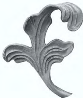
CT-028(R) ( Cast weldable leaf ) 0.310 kg. - 0.683 lbs. Dim. 105 x 165 mm. 4"1/8 x 6"2/4