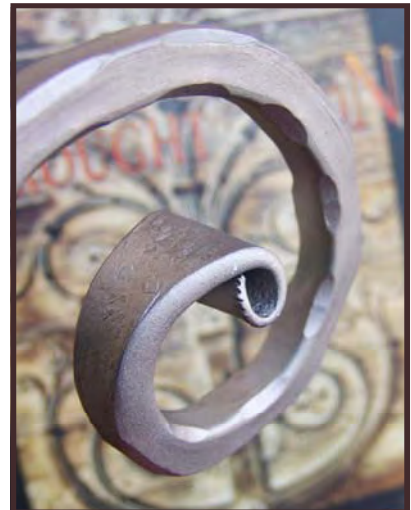
Hot Forged Curl out of square 12mm.

One side with forged curl 0.621 kg.-1.370 lbs. Dim. 150 x 220 mm. 5-7/8" x 8-5/8"