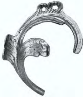
CT-020(L) ( Cast weldable leaf ) 0.410 kg. - 0.903 lbs. Dim. 160 x 190 mm. 2"5/16 x 7"4/8