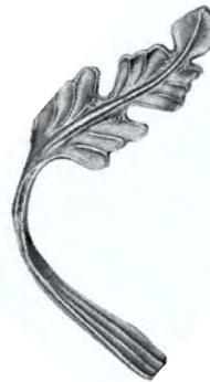
CT-026(R) ( Cast weldable leaf ) 0.365 kg. - 0.804 lbs. Dim. 65 x 230 mm. 2"4/8 x 9"