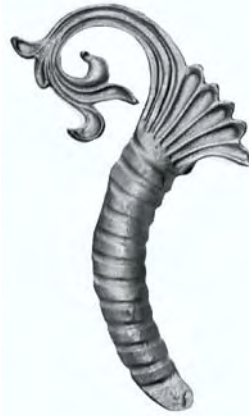
CT-023(L) ( Cast weldable Decor ) 0.800 kg. - 1.763 lbs. Dim. 210 x 340 mm. 8"2/8 x 13"6/16