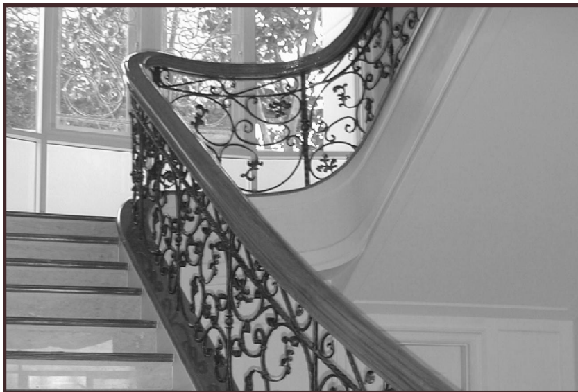
Stair rail with combination of scrolls and Cast Leaves

( Cast weldable leaf ) 0.230 kg. - 0.506 lbs. Dim. 140 x 110 mm. 5-4/8" x 4-5/16"