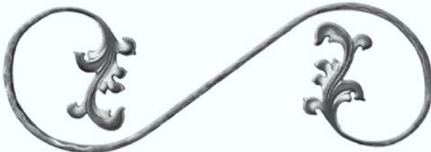
CTS-605HM (12x12) 1.670 kg.-3.681 lbs. CTS-616 (dia.12) 1.400 kg.-3.086 lbs. (Specify Left or Right) mm. 650 x 230 Inch. 25-9/16" x 9-1/16"