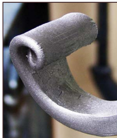
Hot Forged Curl out of square 12 mm.