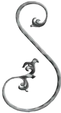
CTS-205HM (12x12) 0.980 kg.-2.160 lbs. CTS-216 (dia.12) 0.800 kg.-1.763 lbs. (Specify Left or Right) mm. 175 x 360 6-14/16" x 14-1/8"