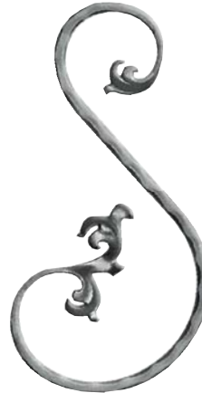
CTS-305HM (12x12) 1.100 kg.-2.424 lbs. CTS-316 (dia.12) 0.880 kg.-1.940 lbs. (Specify Left or Right) mm. 195 x 395 7-4/8" x 15-4/8"