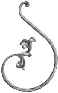
CTS-105HM (12x12) 0.810 kg.-1.785 lbs. CTS-116 (dia.12) 0.665 kg.-1.466 lbs. (Specify Left or Right) mm. 185 x 323 7-5/16" x 12-6/8"