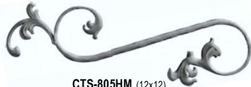
CTS-805HM (12x12) 0.980 kg.-2.160 lbs. CTS-816 (dia.12) 0.875 kg.-1.929 lbs. (Specify Left or Right) mm. 510 x 110 20-1/8" x 4-3/8"