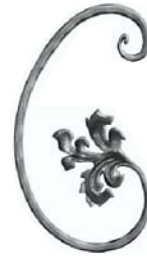
CTC-205HM (12x12) 0.670 kg.-1.477 lbs. CTC-216 (dia.12) 0.545 kg.-1.201 lbs. (Specify Left or Right)