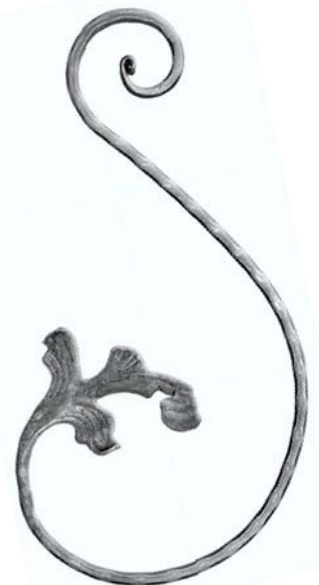
CTS-705HM (12x12) 2.500 kg.-5.510 lbs. CTS-716 (dia.12) 2.150 kg.-4.739 lbs. (Specify Left or Right) mm. 815 x 295 Inch. 32-1/8" x 11-5/8"